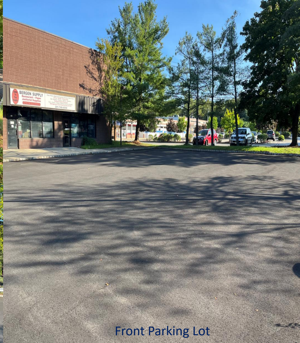
Front Parking Lot