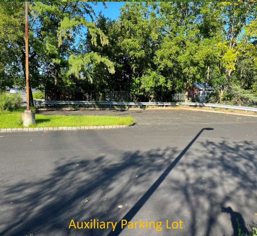
Auxiliary Parking Lot