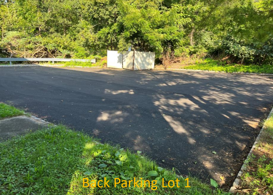
Back Parking Lot 1